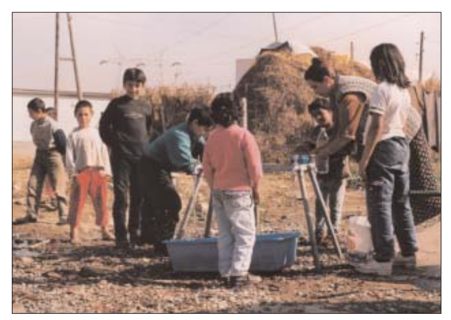
Roma/Gypsy camp in Kosovo

As a starting point, ECRI has recommended that members of Roma/Gypsy communities be guaranteed the right to choose the name by which their community is officially referred to.