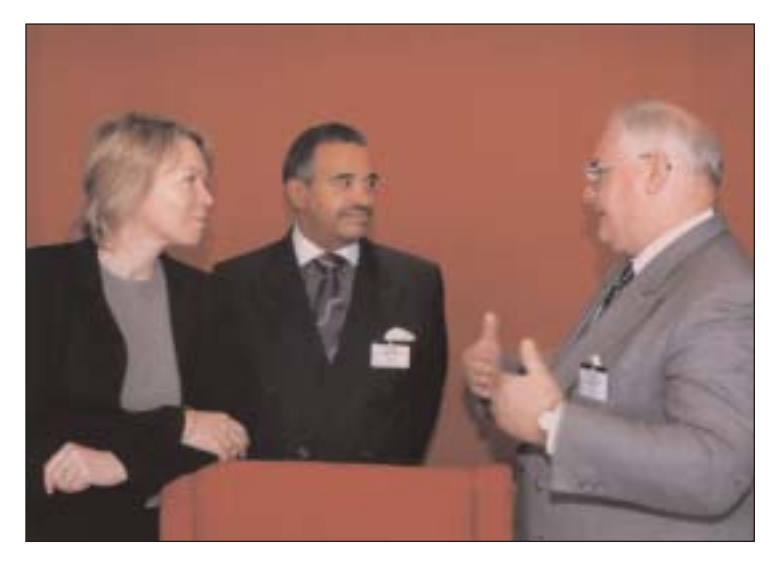
ECRI/EUMC Joint Round Table

focussed on how national legislation can be implemented on the ground, the role of youth groups in combating racism, and mechanisms for community-based dialogue and conflict resolution.