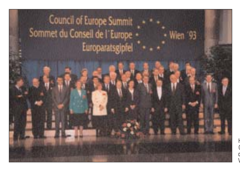
Heads of State and Government of Council of Europe member States, Vienna, October 1993

The European Commission against Racism and Intolerance (ECRI) was established in 1993 by the first Summit of Heads of State and Government of Council of Europe member States.1 It operates under the auspices of the Council of Europe, an intergovernmental organisation based in Strasbourg, France.