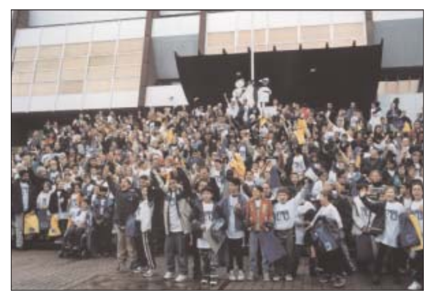
Prelude to the European Conference against Racism, October 2000