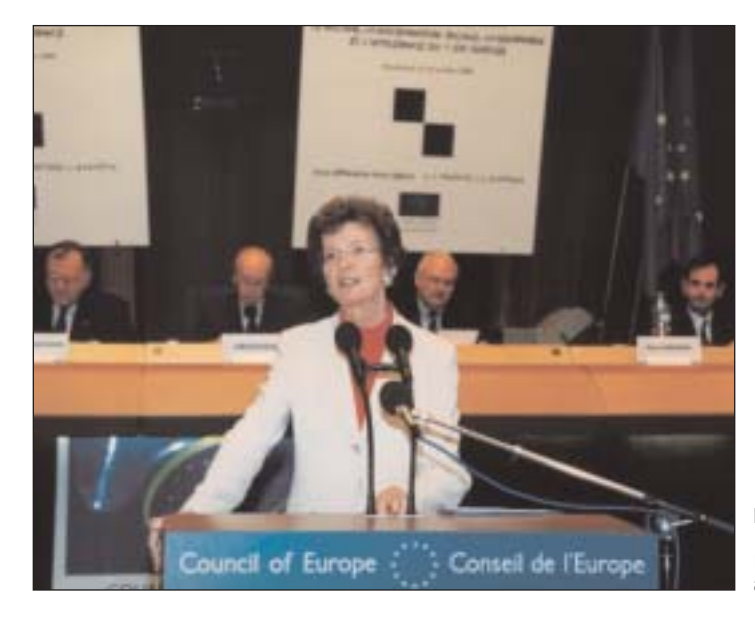
Ms Mary Robinson, United Nations High Commissioner for Human Rights at the European Conference against Racism. October 2000

The European Conference Against Racism, entitled "All different, all equal: from principle to practice", took place in Strasbourg, France in October 2000 and was organised by the Council of Europe. 570 participants attended, including government ministers and officials, representatives of intergovernmental organisations including the Council of Europe, the European Union and United Nations bodies, and representatives of NGOs and civil society. A Political Declaration and General Conclusions, forming the contribution of Europe to the World Conference, were adopted by ministers of Council of Europe member States. The principal elements of the Political Declaration and the General Conclusions are summarised below.