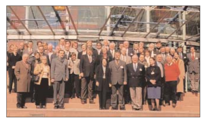
ECRI at its 30th plenary meeting in Strasbourg

To meet the challenges of the coming years, ECRI must be prepared to invest in enhancing the impact of its work, by continuing to look for the best ways in which to strengthen its contribution to the fight against racism. ECRI must also ensure that it preserves the elements which have sustained the quality of its work to date. It must remain impartial, open to dialogue, act completely independently and employ a collegiate approach. It must retain the guiding principle, which it has always respected, of treating States on an equal footing, examining the situation in each member State without fear or favour. Above all, ECRI must continue to work from the perspective of human rights, human dignity and equality which breathes life into the fight against racism and intolerance.