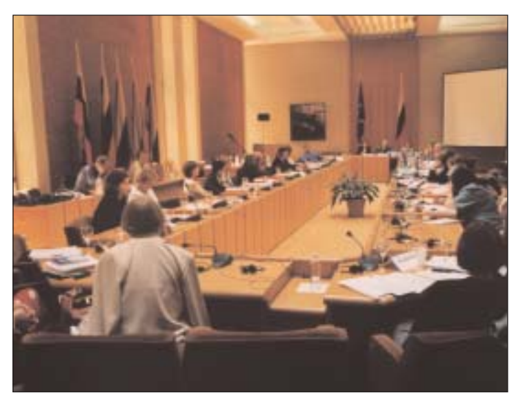
ECRI's Round Table in Lithuania on 12 June 2003

the Roma/Gypsy community, asylum-seekers and refugees, including Chechens and Afghans. Issues such as the protection afforded by existing legal provisions aimed at countering manifestations of racism and racial discrimination, including in the media, were also discussed.